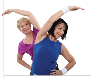
Continued on reverse →

Regular exercise such as walking and bicycling promotes good posture and prevents injury.